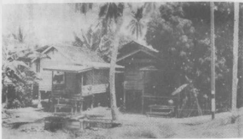
A Bungalow of the People.