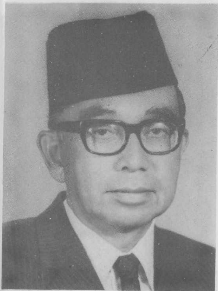
The late Tun Abdul Razak Dato' Hussein. He is the property of the people, especially the people of Pahang. None of the people has forgotten his services. Whoever insults him insults the people of Pahang. Pity the person who claims to be his own son. He who has climbed up because of his services, prepared also to insult and to knock down his dignity.