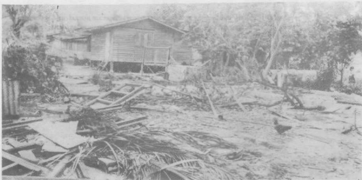
The Wisma of the People. See the extremely pleasant surroundings!