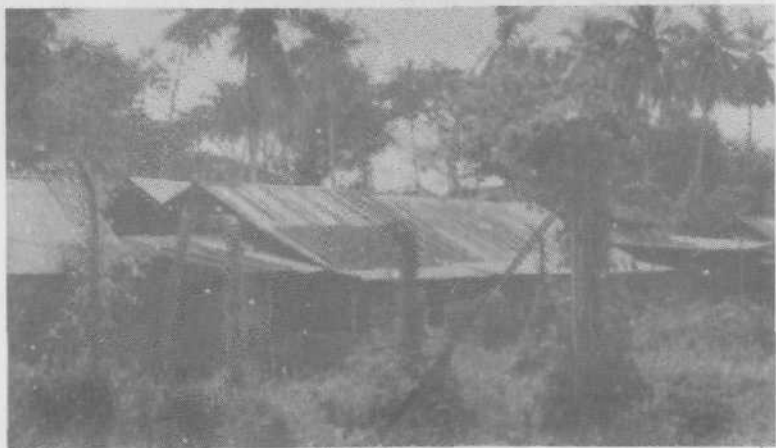
The People's Houses.