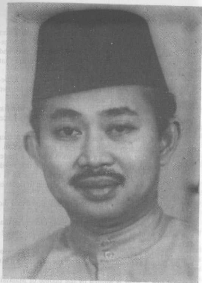
YBM Tengku Tan Sri Razaleigh Hamzah. A unique leader of the people who has brought many good changes for the peace of the people's livelihood A prince with the spirit of the people who has sacrificed and will sacrifice anything for the interests of the country and the welfare of the people, particularly the Malays.